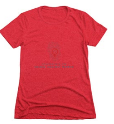
Women's Slim Fit Tee $17.50 Available in other colors