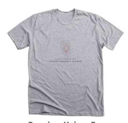
$ 17.50 Available in other colors