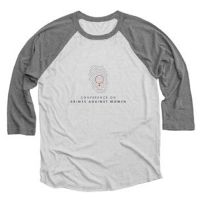
3/4 Sleeve Baseball Tee $21.50 Available in other colors