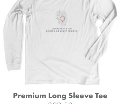
$22.50 Available in other colors